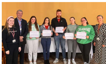
Key milestones in the undergraduate calendar page 3