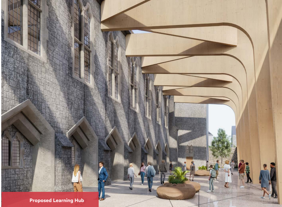
Proposed Learning Hub

Our plan is to celebrate the existing Pugin architecture and complement it with the new development. The College and the town of Maynooth are extensions of each other. Consequently we are very conscious of ensuring that our project is developed to the highest standards of accessibility, technology and environmental sensitivity, including open gathering spaces and walkways to the benefit of all.