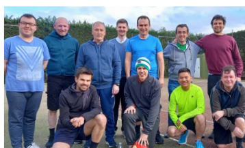
Another busy and fruitful semester at the Seminary page 5