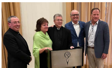
Visit to the U.S. page 2