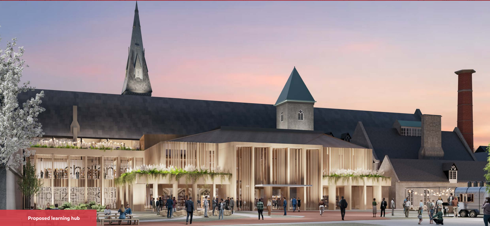
Proposed learning hub

The newsletter of St Patrick's Pontifical University & St Patrick's National Seminary