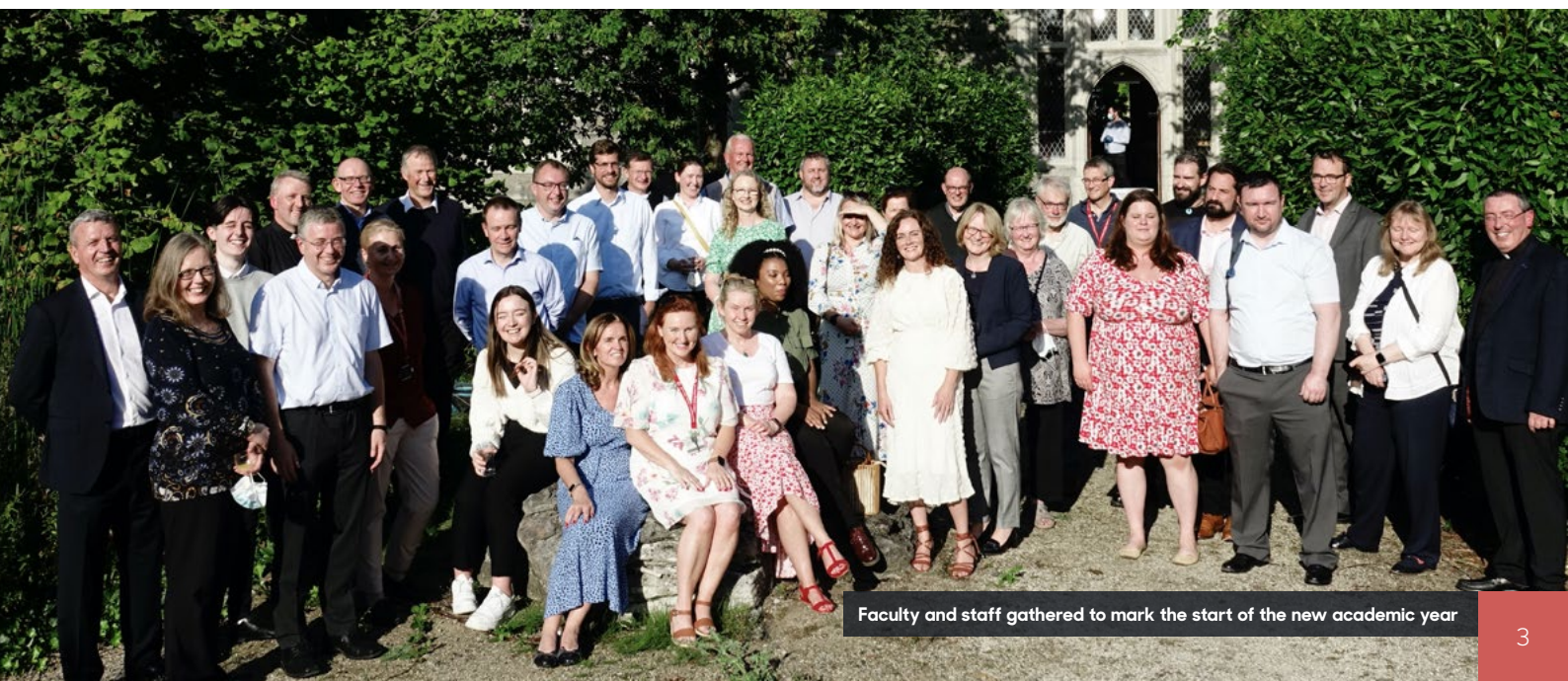
Faculty and staff gathered to mark the start of the new academic year