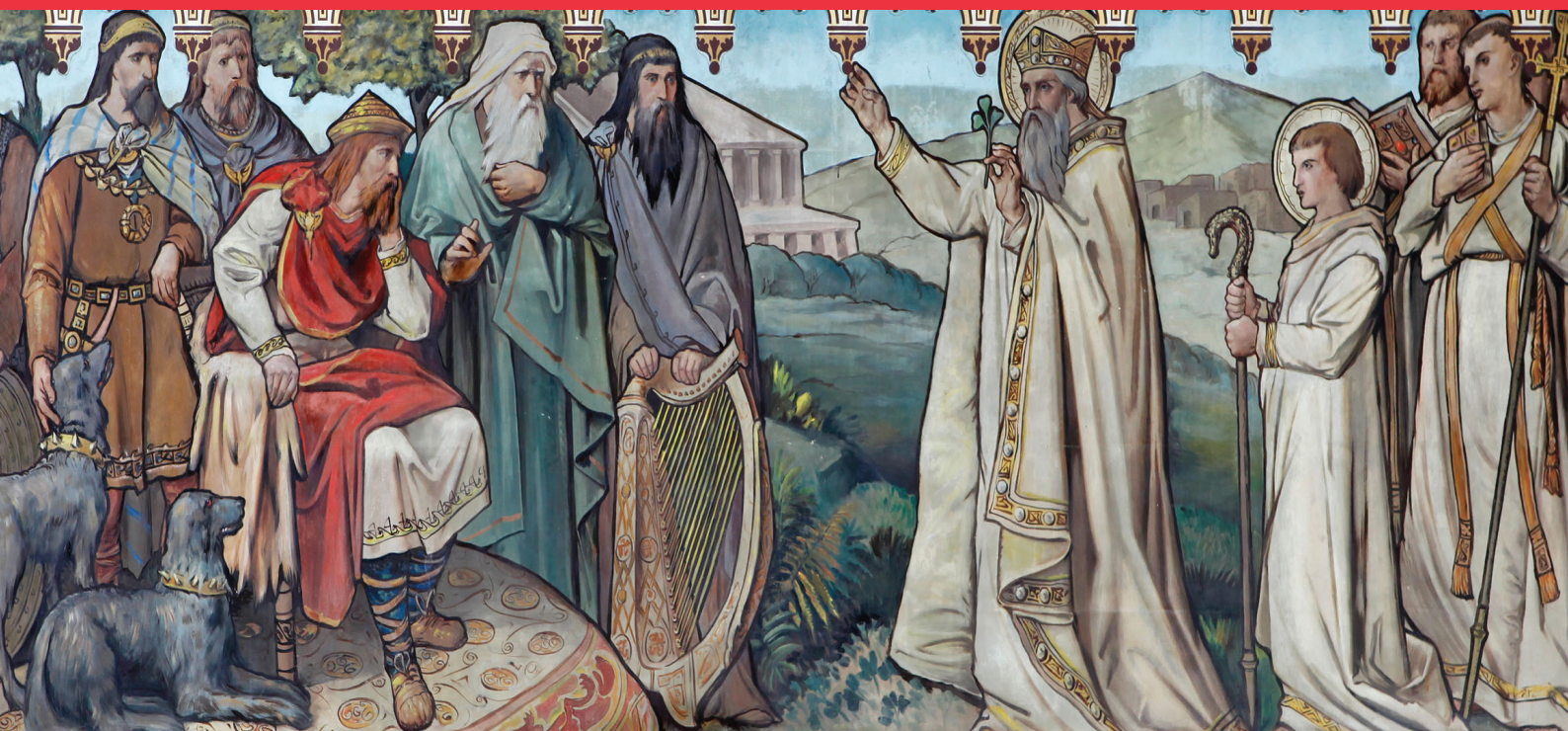
Using a shamrock Saint Patrick teaches the mystery of the Trinity to the High King of Ireland