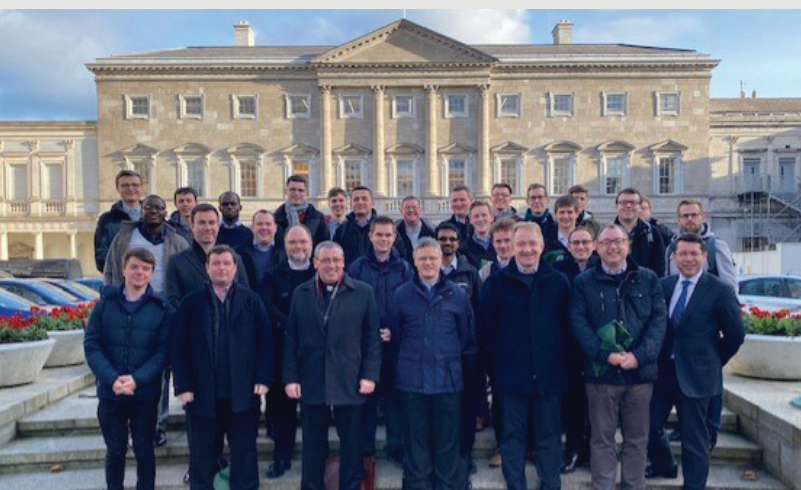
Senator Rónán Mullen (front row at right) welcomed the Seminary Community to Leinster House on 30 January 2020