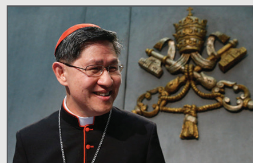
Cardinal Tagle is known to be very close to Pope Francis and shares his synodal vision for a missionary church.

In 2015, Cardinal Tagle became president of Caritas Internationalis , a confederation of 165 Catholic relief, development and social service organisations, including Trócaire , which operate in more than 200 countries worldwide.