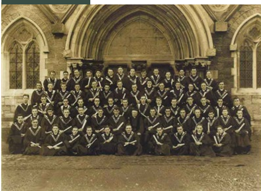
1924 BA Classpiece