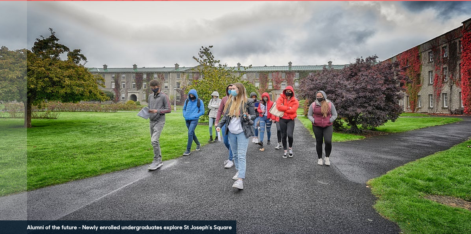
Alumni of the future - Newly enrolled undergraduates explore St Joseph's Square