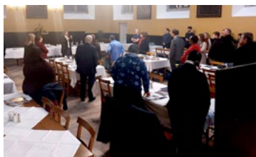
Launch of Diploma in Youth Ministry page 4