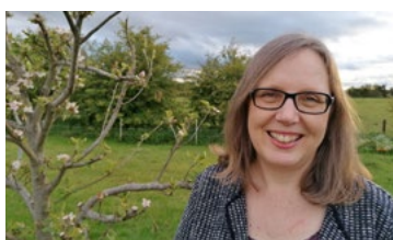
Latest updates from the Dean of Theology page 5