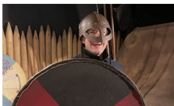
Visit to Christchurch page 3